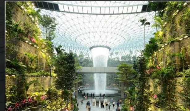
Changi Airport Singapore