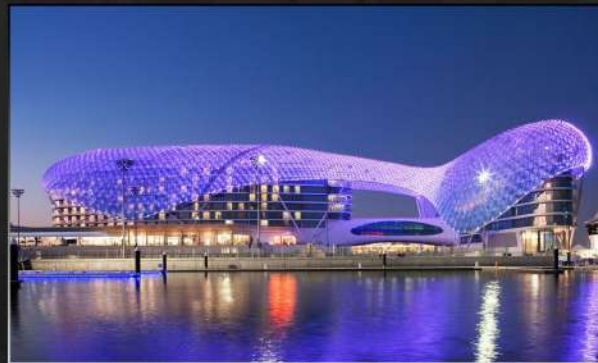
Mesmerising W Yas Island