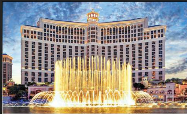
The Fountains of Bellagio