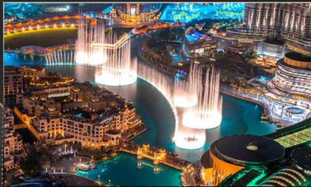
The Majestic Dubai Fountain

PIONEERS IN CURATING FUSION OF ICE, WATER & FIRE