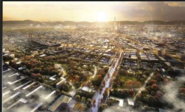
Premium Residential Tashkent