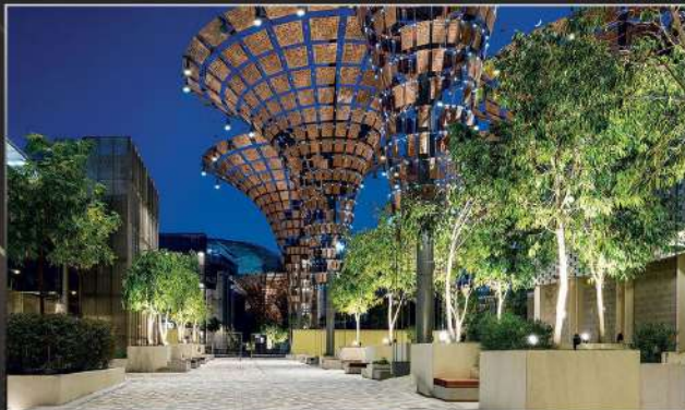
Dubai Expo 2020