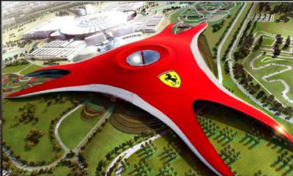
Ferrari World Abu Dhabi