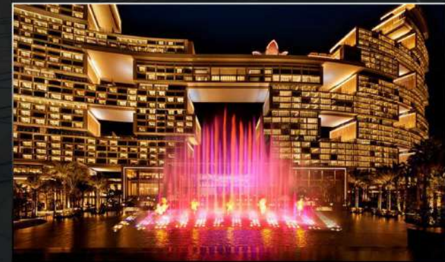
Atlantis The Royal Dubai