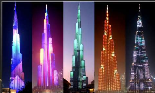
Burj Khalifa's Media Facade