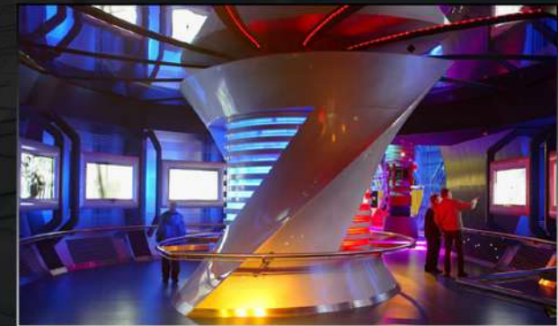
Space Park Germany, UK