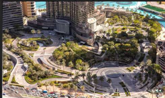
Iconic Burj Khalifa