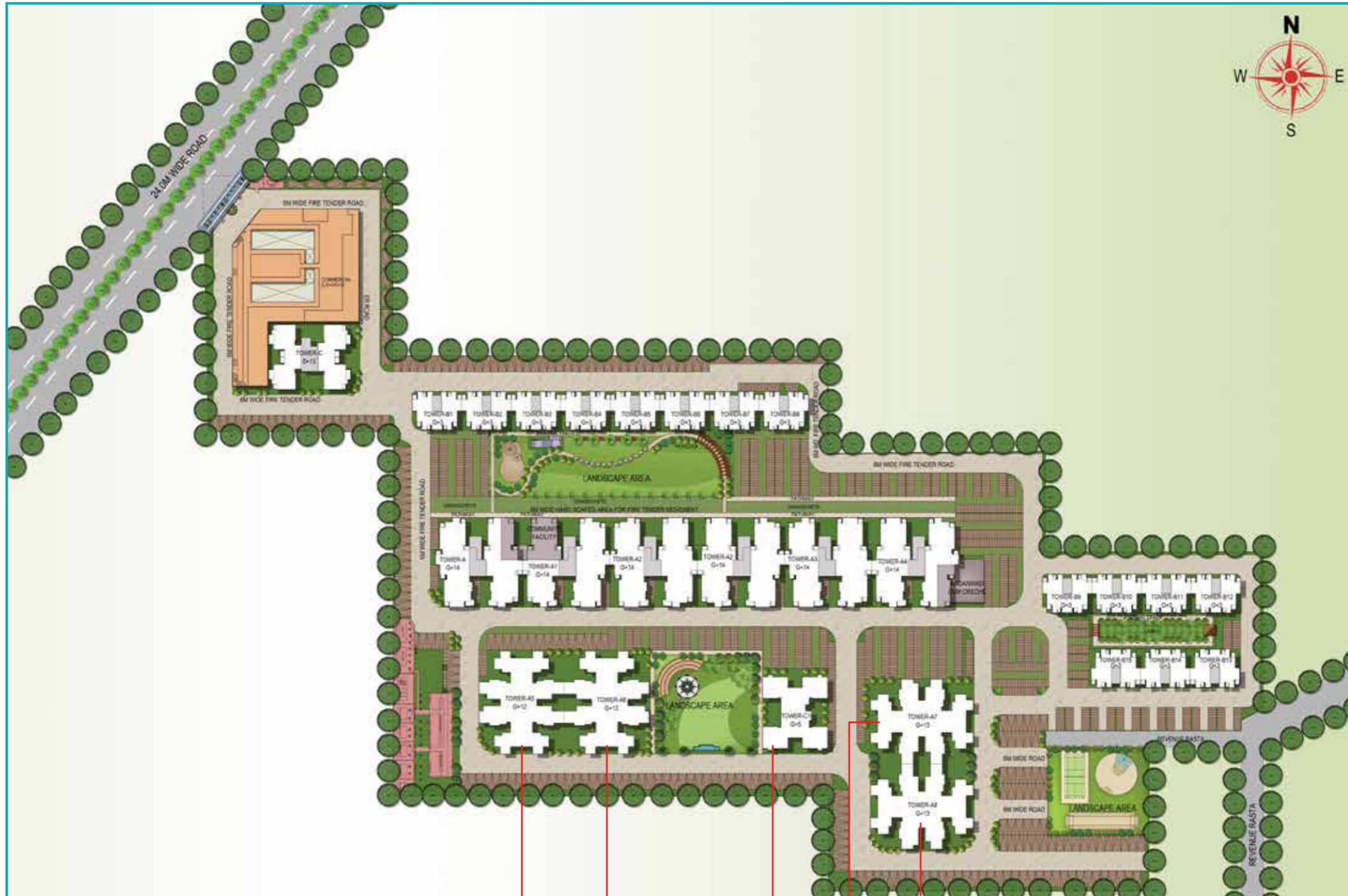
Artistic Site Plan