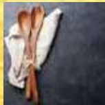
COUNTER TOP GRANITE STONE