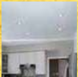
WALL / CEILING OIL BOUND DISTEMPER