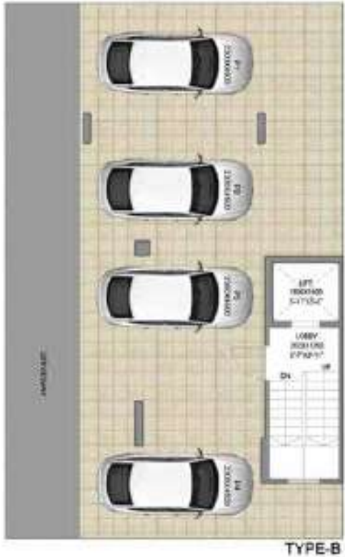
STILT FLOOR PLAN