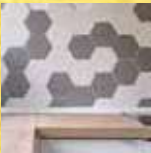
DADO CERAMIC TILES 600 MM ABOVE THE COUNTER