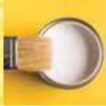
WALL ACRYLIC EMULSION