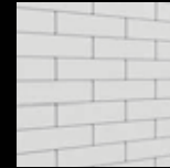
BOUNDARY WALL RCC / BRICK WALL WITH PLASTER & EXTERNAL WEATHER PROOF PAINT FINISH