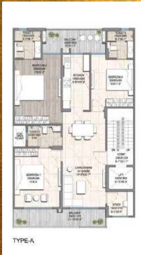
1 ST TO 4 TH FLOOR PLAN