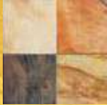
FLOOR VITRIFIED TILES