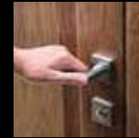
MAIN / INTERNAL DOOR FRAME HARD WOOD / RED MERANTI