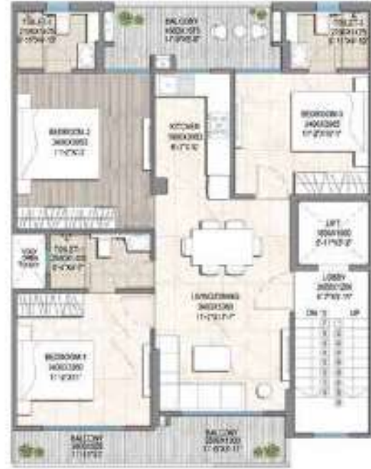
1 ST TO 4 TH FLOOR PLAN