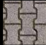
INTERNAL ROADS INTERLOCKING BLOCKS/ TREMIX CONCRETE ROAD