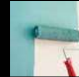
EXTERNAL PAINT WEATHER PROOF TEXTURE PAINT IN BUILDINGS