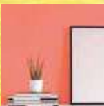
WALL ACRYLIC EMULSION