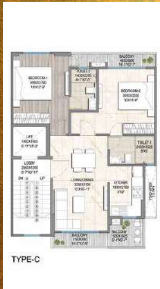
1ST TO 4 TH FLOOR PLAN