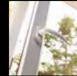
EXTERNAL DOORS & WINDOWS UPVC/ALUMINIUM POWDER COATED