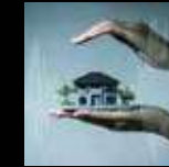
EARTHQUAKE RESISTANT RCC FRAMED STRUCTURE AS PER SEISMIC ZONE