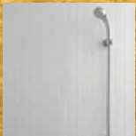
WALL CERAMIC TILES TILL 4 FEET / 7'-0" FEET