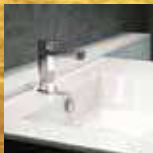
FITTINGS & FIXTURES ISI MARKED CP FITTINGS, WC & WASHBASIN