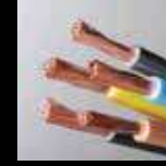
WIRING COPPER ELECTRICAL WIRING THROUGHOUT IN CONCEALED CONDUIT FOR LIGHT POINTS