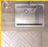
FLOOR VITRIFIED / CERAMIC TILES