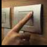
SWITCHES / SOCKET ISI MARKED SWITCHES & SOCKETS