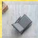
BRICKBAT COBA OR WATER PROOFING TREATMENT