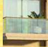
RAILING GLASS RAILING