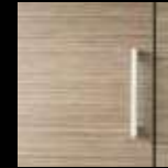
INTERNAL DOOR SHUTTERS BOTH SIDE LAMINATED DOORS