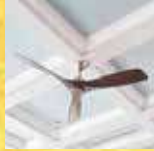
CEILING OIL BOUND DISTEMPER