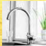
FITTINGS & FIXTURES ISI MARKED CP FITTINGS & SS SINK