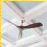
CEILING OIL BOUND DISTEMPER