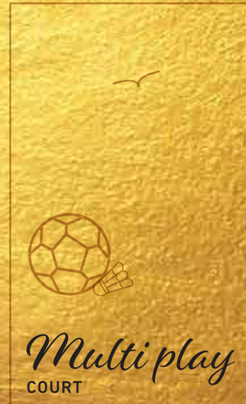
Multi play COURT